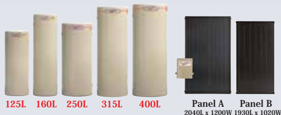
125L 160L 250L 315L 400L

Call 1800 676 000 or visit our website at aquamax.com.au for more information.